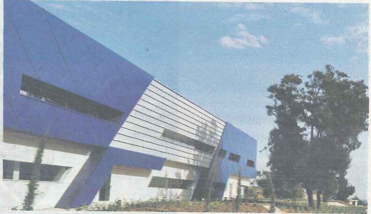
Il-Hub tal-Innovazzjoni ta' Malta jiffirma parti mill-Park tax-Xjenzi tal-Ħajja ta' Malta

Il- Profit with Purpose qegħda tkun organizzata flimkien mal-Kunsill Malti għas-Settur Volontarju kif ukoll mal-Impact