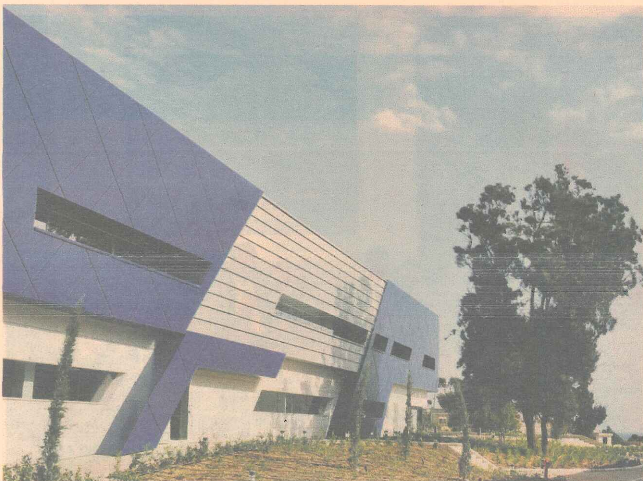
The Malta Innovation Hub forms part of the Malta Life Sciences Park